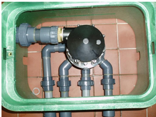
Our Indexing valves can pump water to 2- 6 independent cells in sequence using a single pump. Useful for large systems or to use small parcels of a small site.

Picture 1 opposite shows start of lateral valve accessible through valve box to balance flows by partially opening or closing valves and to allow laterals to be shut off if necessary.