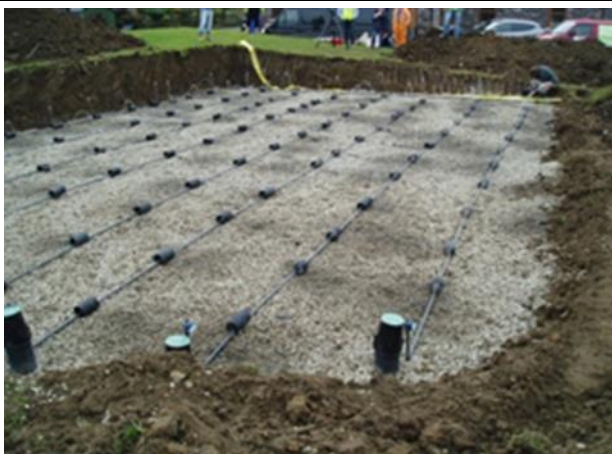
As featured on ECO-EYE. Testing system pressurisation with water