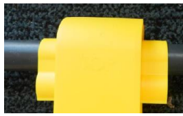
Orifice shields are available to prevent holes being blocked with soil –or cuts of 110 mm pipe can be placed directly over pipes.