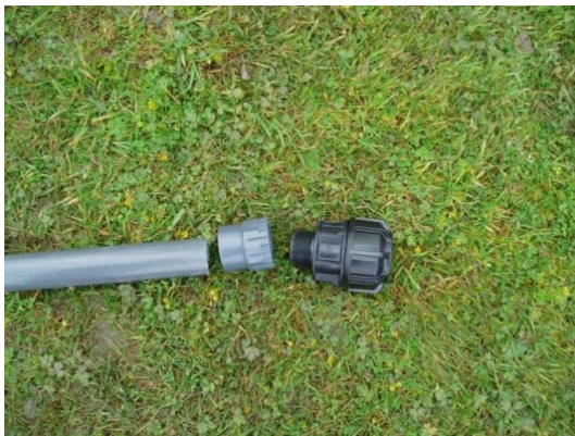
A female 40 mm to 1 1/4" threaded fitting is supplied for connecting to (at least 1 1/2") rising main. (Black Philmac fitting not supplied)